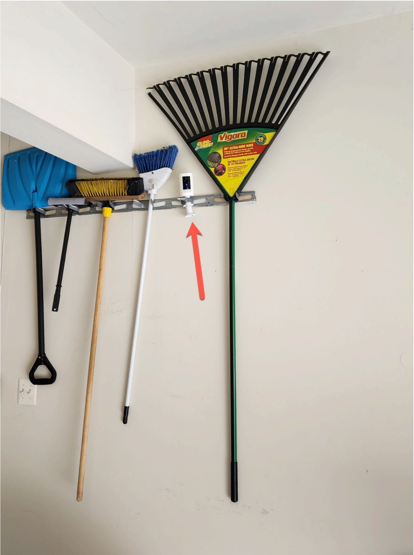
When it came to exterior cameras, my first priority was capturing footage of anyone approaching the front door, as well as having the ability to engage in